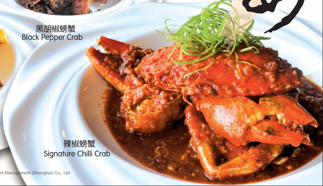
辣椒螃蟹 Signature Chilli Crab