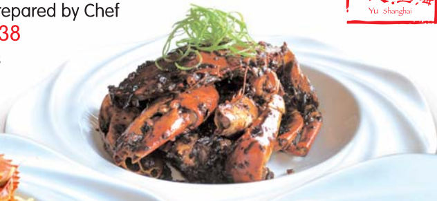
黑胡椒螃蟹 Black Pepper Crab