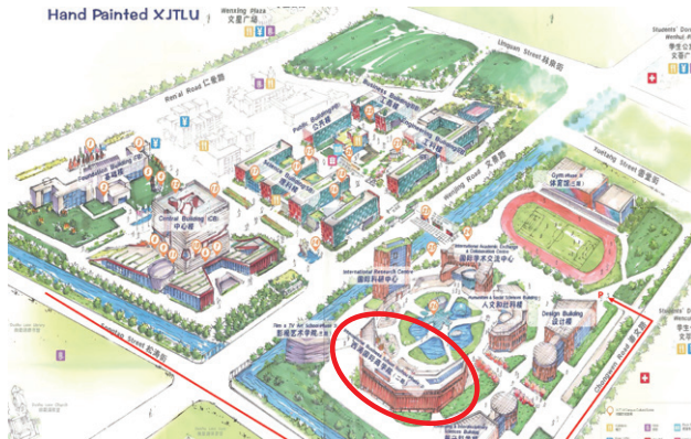
IBSS Building (South Campus of XJTU), 8 Chongwen Road, Dushu Lake Science and Innovation District, Suzhou Industrial Park, Suzhou, Jiangsu, China 215123

What is Real Digital Intelligent Transformation Why China now is in such a moment of Transformation What will be Critical Success Factors for Transformation How to Setup Roadmap in Macro/Micro scale